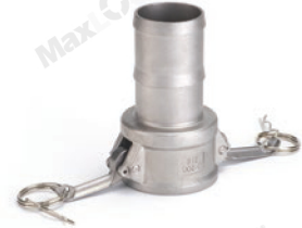
HOSE SHANK COUPLER

Be attached directly to uncoupled hose with any type of clamp or bands