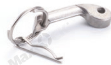
HANDLE WITH PIN

CAM ARM: Brass, Stainless Steel Pin: Stainless Steel